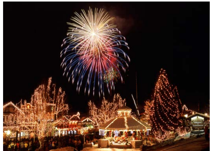
Fireworks Over Christmas Lighting Festival