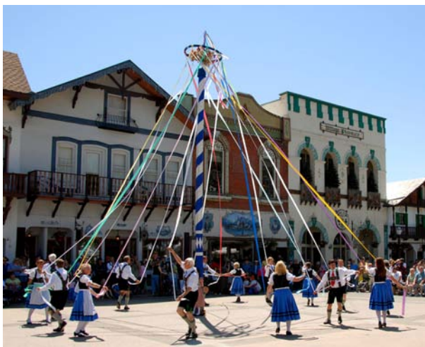
Dancers Celebrating Maifest

The town was resuscitated in 1962 when a city Project LIFE (Leavenworth Improvement for Everyone) Committee gathered a consensus to remodel the town into a Bavarian hamlet. Community members began several large events that continue to the present day – the Autumn Leaf Festival, Maifest, a tremendous Oktoberfest celebration, and Leavenworth's signature Christmas Lighting Festival.