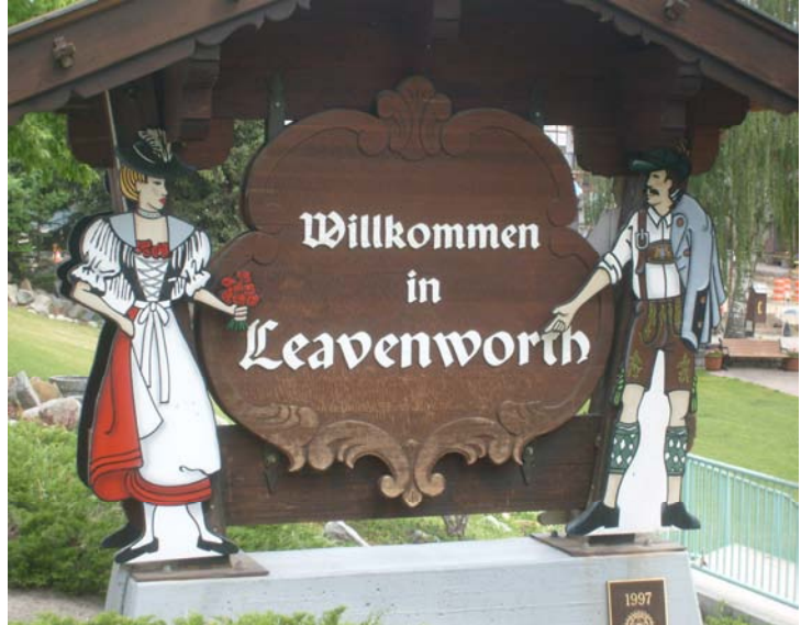
Leavenworth's Bavarian Welcome

The LEAVENWORTH NUTCRACKER MUSEUM ( www.nutcrackermuseum.com ), located downtown at 735 Front St., houses over 5,000 nutcrackers, some dating back to the 16 th and 17 th centuries. A kids' favorite since its creation in 1995, the museum is a menagerie of figurines that value artistic form over function – animal and cartoon likenesses are prominently featured. The centerpiece of the museum, said to be the only one of its kind in the United States, is a 2,000-year-old Roman metal nutcracker unearthed in 1960. Included in the admission rate is a 14-minute video that traces nutcrackers through history and introduces the museum. Limited operating hours – 2-5pm daily, Sat-Sun only Nov-Apr. Phone (509) 548-4573. (Admission)