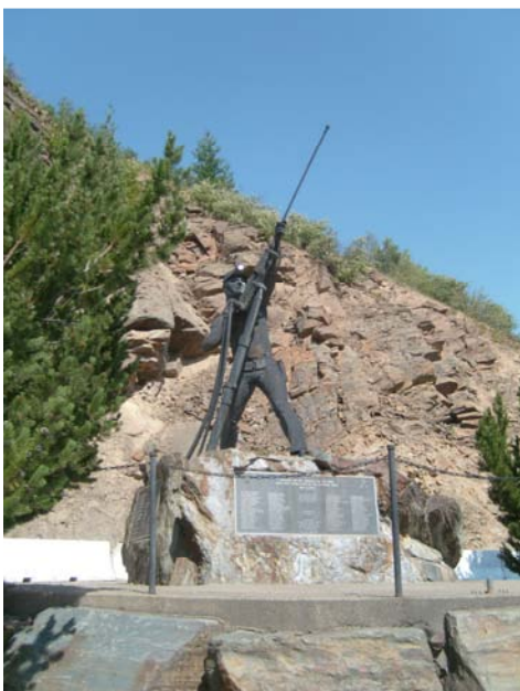
Sunshine Mine Memorial

Proceed north on Fifth Street and follow the road around to the left in front of the I-90 flyway and becomes Silver Valley Road (also signed Business Loop 90). This county road maintains an unusually slow speed limit for its width, a fact owing to the large number of combination trucks that once clambered from town to mine. Two miles along is an underpass for the small residential community of SILVERTON (pop. 720, alt. 2,720 ft.) and three miles on the road enters OSBURN (pop. 1,459, alt. 2,530 ft.).