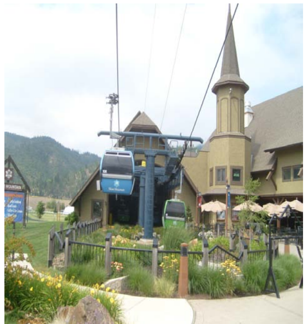
Silver Mountain Gondola

The resort consists of two mountains – both Wardner Peak and Kellogg Peak nose above 6,200 feet elevation and feature pistes with descents of up to 2,200 vertical feet. The Terrain Park is home to boarders, tubers and shredders of all abilities. Gondola Village features restaurants and the pet-friendly lodge. The newest attraction is Silver Rapids Indoor Waterpark , home to tube slides, rafting and other water features for all ages.