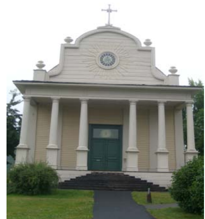
Sacred Heart (Cataldo) Mission

In later years, the mission building served as a hospitality station for miners and others settling in the Silver Valley. The restored Parish House next door houses period artifacts and room décor as well as exhibits describing the relationship between the priests and native peoples. A new visitor center is under construction at the park's north end and interpretative trails are scattered throughout the 18-acre layout. The park is open daily year-round with extended summer hours.