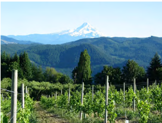
Vineyards dot the bench above Underwood – Mt. Hood forms a scenic backdrop.

The Columbia River has carved a magnificent path through the Cascade Range. The mountains form a climatic barrier between the mild, humid west and the drier east, where seasonal temperature ranges are more extreme. These diverse weather conditions make the Gorge a natural wind tunnel. The Columbia Gorge AVA occupies the eastern part of the Gorge, centered on Bingen, White Salmon and Lyle on the Washington bank and Hood River and its namesake valley on the Oregon side. Some of the vineyards are on benches above the river, others are on the flats facing the Columbia; still more cluster near Lyle and in the Hood River Valley and near Mosier, Oregon. Snowcapped volcanic peaks (Mt. Adams and Mt. Hood) form a backdrop, adding to the scenic allure of the region.