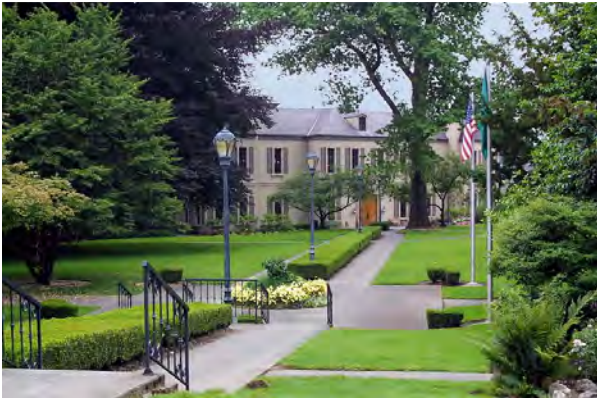
Chateau Ste. Michelle is Washington's oldest winery (1954). It is also the world's largest producer of Riesling. The winery hosts a series of outdoor summer concerts.

Woodinville Village , on SR-202 at NE 145th Street, is a $200 million mixed-use development. Capitalizing the city's wine industry, the Tuscan-style complex will include residences, retail, restaurants, wineries and tasting rooms. The following wineries plan to relocate to Woodinville Village: Brian Carter, De Lille, Di Stefano and Washington Wine Company. The first phase opened in 2008.