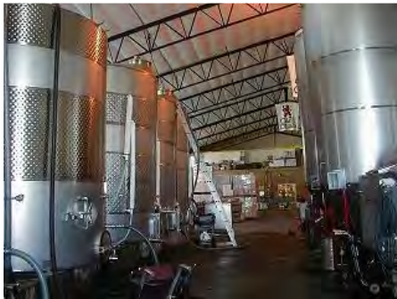
Claar Cellars' production facility.

TOPPENISH , 3 miles south of I-82 exit 50, is one of the valley's most interesting towns. Seventy colorful murals decorate the exterior of buildings mostly in the central business district, lending Toppenish its nickname, the "City of Murals." Horse-drawn carriage rides offer a fun way to see the sights and learn about the mural program. Attractions include the American Hop Museum, Northern Pacific Railway Museum and the Yakama Nation Cultural Center.