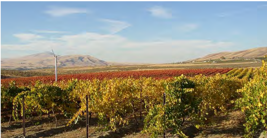
Kiona Vineyard, in the Red Mountain AVA near Benton City

Wine making in Washington dates back to vines planted at Fort Vancouver (present-day Vancouver) in 1825. The first hybrid grape varieties appeared in the Puget Sound region as early as 1854 and the Walla Walla Valley by 1860. By the first decade of the 1900s, French, Italian and German immigrants had planted vineyards in many parts of the state. Kennewick held its first annual Columbia Valley Grape Carnival in 1910.