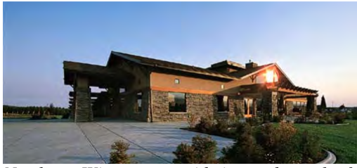
Northstar Winery, set amid vineyards south of Walla Walla, specializes in Merlot

The city of Walla Walla is compelling as well. Carefully preserved buildings of brick and stone grace its downtown area. Late nineteenth- and early twentieth-century homes nestle among trees in surrounding residential districts. The valley's bounty attracted settlers in the mid-1800s. Historical attractions such as Fort Walla Walla and Whitman Mission National Historic Site recall these early days. Whitman College, the oldest in Washington (1859), is a renowned institute of higher education.