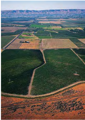
Irrigation makes the Yakima Valley a gardenlike patchwork of vineyards and row crops.

children, especially the younger kids. A path encircles the lake and on summer weekends you can rent paddleboats. Completing the prehistoric theme, the park's restrooms are shaped like a volcano and the snack bar is called the Dino-Store.