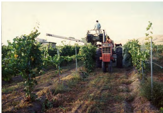
Harvest time at Badger Mountain Vineyard

farms. Today it's the most populous of the triad. The region's economy changed drastically in 1942 when the government moved tens of thousands of people into the area to work on the top-secret Manhattan Project. This gave rise to the planned city of Richland. After World War II, the Tri-Cities economy diversified as industrial concerns moved in to take advantage of cheap power.