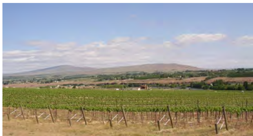
Chandler Reach Vineyard at the east end of Yakima Valley, near Benton City.

Yakima Valley wineries participate in a series of annual events: Red Wine and Chocolate (President’s Day weekend); Spring Barrel Tasting (last full weekend in April); Thanksgiving in Wine Country (Thanksgiving holiday weekend).