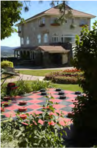
The historic Cliff House at Arbor Crest

Outdoor recreation abounds. The area is noted for its affordable golf and in winter nearby Mount Spokane beckons downhill and cross-country skiers and snowboarders. The Centennial Trail is a paved, multi-use recreational trail linking Riverside State Park, north of the city, with the Idaho border.