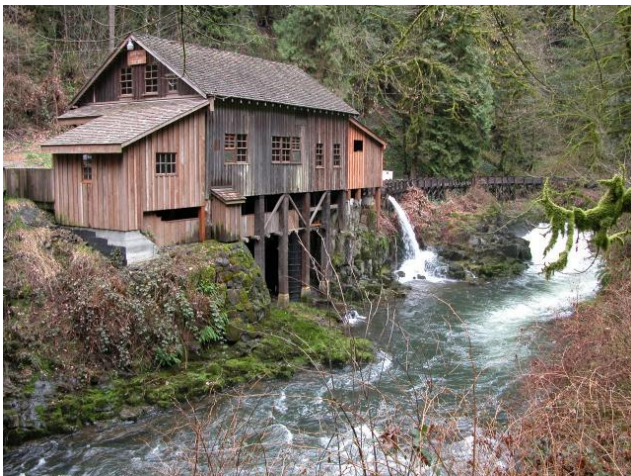
Cedar Creek Grist Mill dates from 1874

Highway 503 twists down to the Lewis River. Look upstream (right) to the high, earthen face of Yale Dam. The road winds through forested, hilly terrain, emerging onto a small farming valley at CHELATCHIE (pop. 30, alt. 505 ft.), where a ranger station houses the administrative headquarters of the Mount Saint Helens National Volcanic Monument.