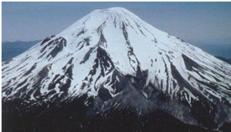
The symmetrical cone of St. Helens from the north, June, 1970

At 8:32 in the morning of Sunday, 18 May, 1980, Mount Saint Helens volcano erupted with a force that drastically changed the geography of a sizeable chunk of southwestern Washington. That eruption discharged twelve percent of the mountain’s mass into the atmosphere, reducing its height by 1,300 feet. An avalanche of ejected material rushed down the volcano’s shattered north face, laying waste to some 200 square miles of forest and transforming pristine Spirit Lake into an unrecognizable scene of devastation. Hot gas stripped trees of their leaves and mowed down giant conifers like matchsticks. Virtually all signs of life were obliterated. Fifty-seven people and countless animals perished in the cataclysm. The creeks and streams born in this impact area soon carried a choking flow of hot mud and debris far downstream, causing great loss of property. In recent years the volcano has been quiescent.