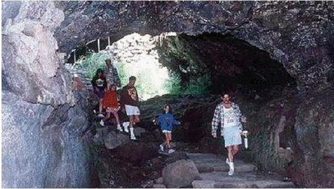
Entrance to Ape Cave

old-growth Douglas-fir, western red cedar and marshland. Forest Road 25 ends at the Lewis River Road (FR-90), which turns west, hugging the steep, forested shore of Swift Reservoir.