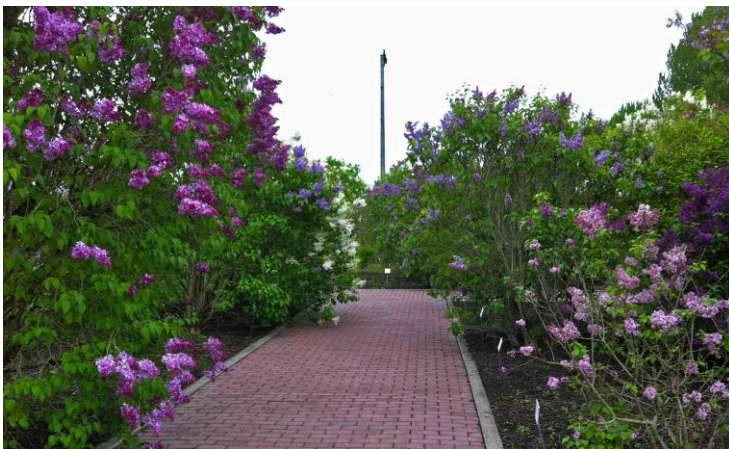
Hulda Klager Lilac Gardens in Woodland

Near Paradise Point State Park (camping) I-5 drops down a bluff to cross the East Fork of the Lewis River. Several miles upstream, the town of LA CENTER (pop. 3,320, alt. 110 ft.), east of I-5 exit 16, was a bustling river port in the late 19th century. The remains of one of the old sternwheelers sits in the river just west of the bridge. The town hosts a farmer's market on summer Saturdays. The La Center Historical Museum , 410 W. Fifth Street, has vintage photographs illustrating early logging and river boats. Mills in the Lewis River area are said to have produced 60 percent of the railroad ties used in the west coast. The museum is open limited hours; phone (360) 263-3308.