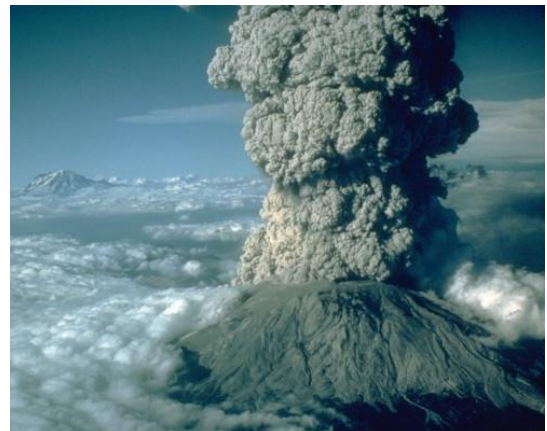
St. Helens in full eruption, 18 May, 1980

Our self-guiding Auto Tour traces a suggested itinerary around Mount Saint Helens – offering a unique opportunity to view this region where nature’s awesome power and dynamic for regeneration are ever evident.