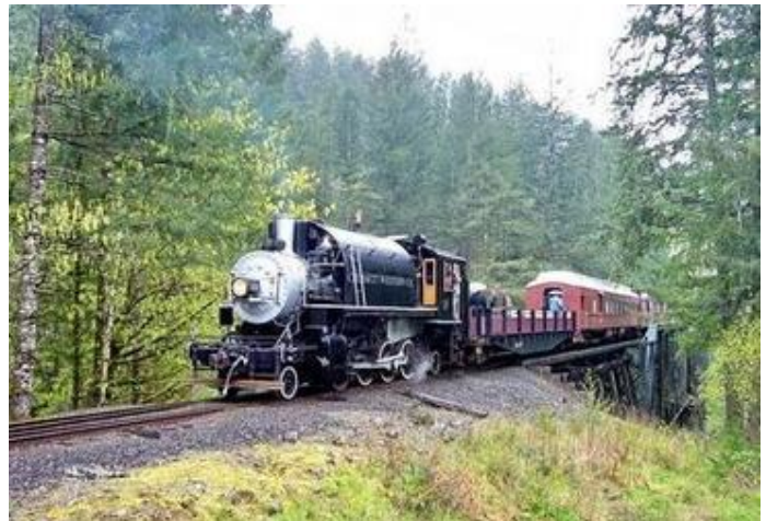
Some Chelatchie Prairie trains are hauled by a steam locomotive