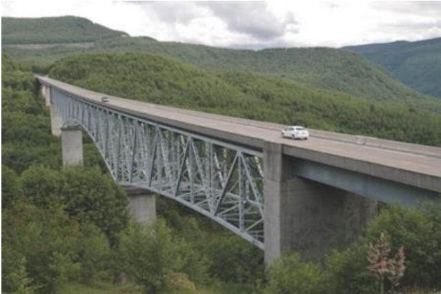
Hoffstadt Creek Bridge spans a wooded gorge. Tall trees obscure clear views of the bottom of the canyon.

The highway continues along the North Fork Toutle River, scene of major flooding in the aftermath of the 1980 eruption. Massive jams of logs and mud pushed downstream devastating homes, roads and a logging camp, where it tossed railroad cars around like toys. Three-and-a-half miles east of the hamlet of KID VALLEY (alt. 775 ft.) we reach the end of the pre-eruption route of the state highway. The old route, now buried beneath landslide and mudflow debris, followed the river upstream to Spirit Lake. The new highway, opened in October 1992, climbs a ridge north of the river, then continues eastward well above the valley floor. Along the 22-mile route to Coldwater Ridge are eleven bridges and four viewpoints offering perspectives of the volcano and the devastated upper Toutle River drainage. The highway climbs into the winter snow zone reaching elevations above 3,000 feet. The Department of Transportation keeps the road open as far as Coldwater Lake throughout the year (winter motorists should carry chains or traction devices).