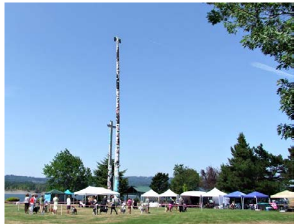
Kalama's Marine Park has a 149-ft. totem pole

WOODLAND (pop. 6,205, alt. 25 ft.) straddles the Lewis River two miles above its confluence with the Columbia. Dikes protect the flood-prone farmland which gives the area its prosperity. Many Finns settled this district in the early 1900s. A park, four miles east of town on SR-503 marks the site of Old Finn Hall , a Finnish